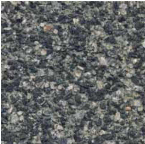
WAUSAU #GTX-2098 6"x12" in running bond pattern