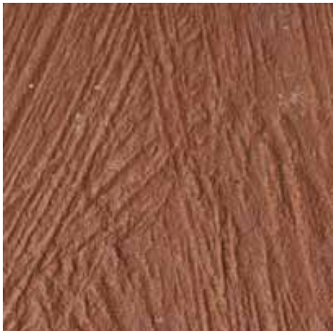
WAUSAU #BR-4008 6" x 12" transition band between sidewalk corner paving and bus zone paving, and 6" x 12" at entire length of Hollywood Boulevard, including bus zones