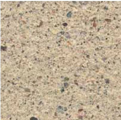
WAUSAU #FDX-7008 warning paver at ramps, truncated domes per DOT