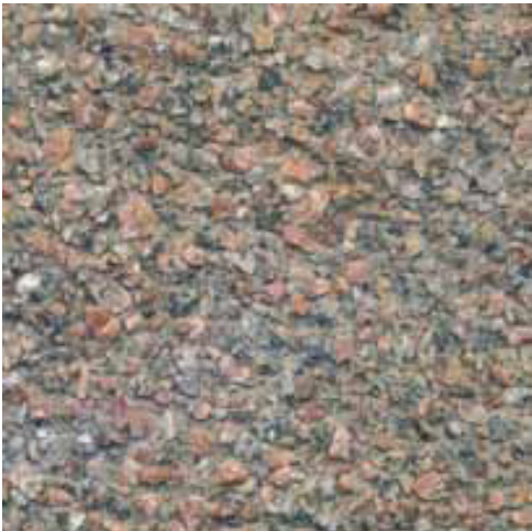
WAUSAU #GTX-2078 12"x12" edge of crosswalk