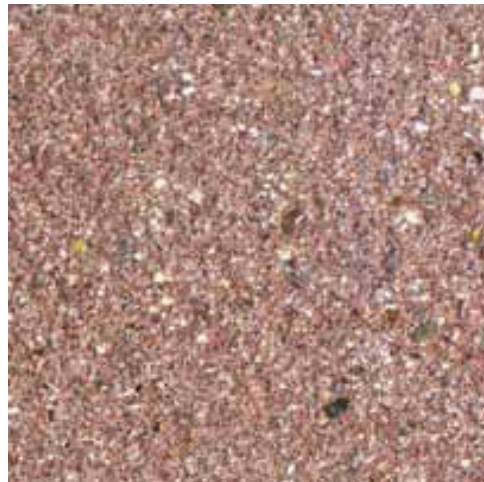
WAUSAU #FDX-4008 30"x30" bus zone paving